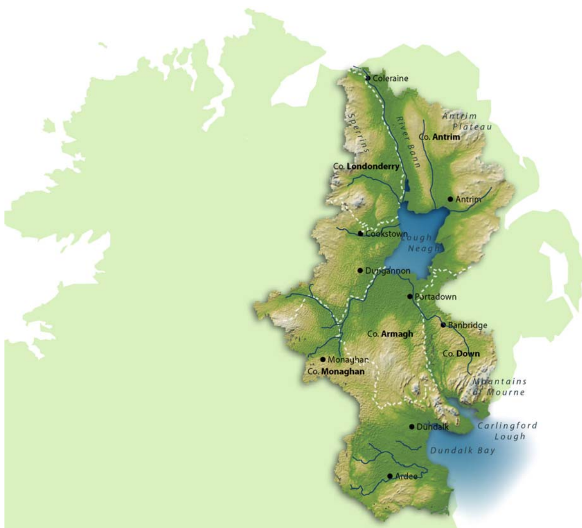
Figure 2.2 Neagh Bann International River Basin District